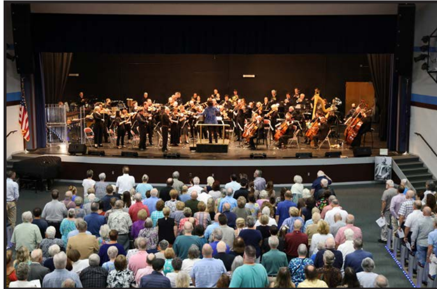
As the concert began, five-hundred voices joined in the Star Banged Banner

The Historical Society believed it was important to recognize this anniversary and to maintain awareness of the community's unique history. Thanks to the generosity of individuals, businesses, and organizations the concert costs were raised.