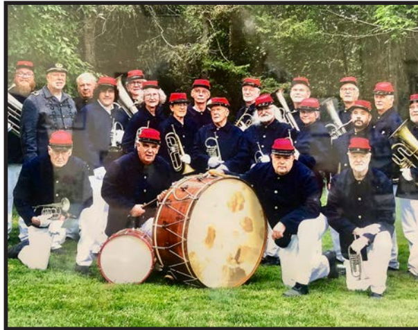
Yankee Brass Band

Headquartered in Vermont, the two dozen members of the Yankee Brass Band tour communities that welcome their unique historical performances. Palmerton's beautiful bandstand and park setting came to their attention as they planned a whirlwind tour of the area. With performances already scheduled for Honesdale on July 19th,