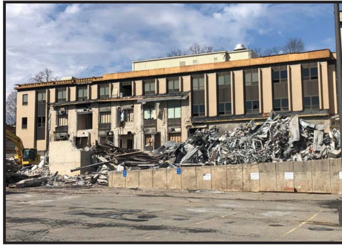
March 1, 2023