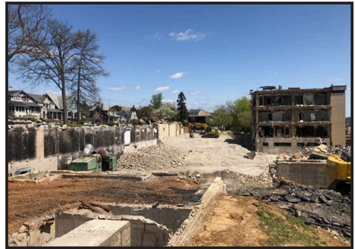
April 19, 2023