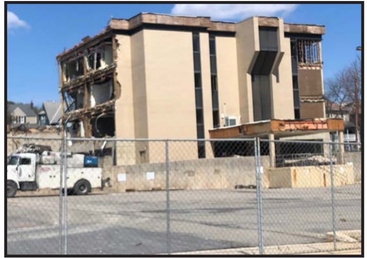
March 29, 2023

Residents now await news as to the plans St. Luke's has for the site. Future issues of The Scribe will keep our readers apprised of developments as one chapter in Palmerton's rich history ends and a new chapter begins.