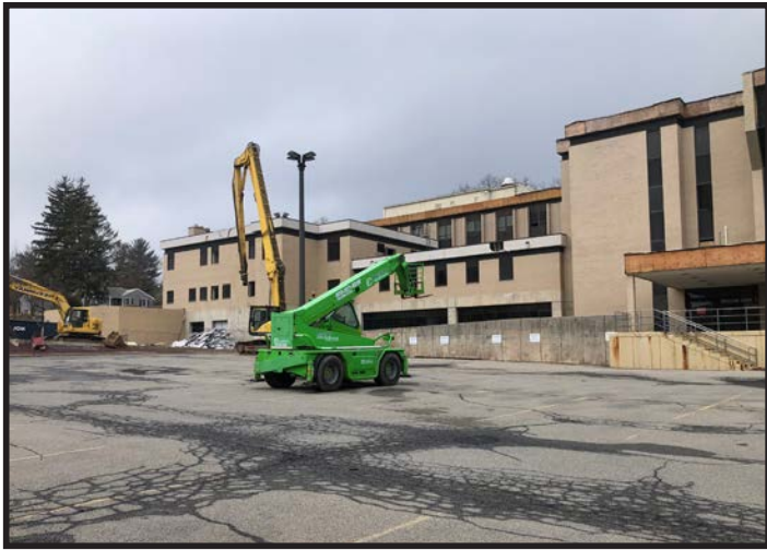
February 21, 2023