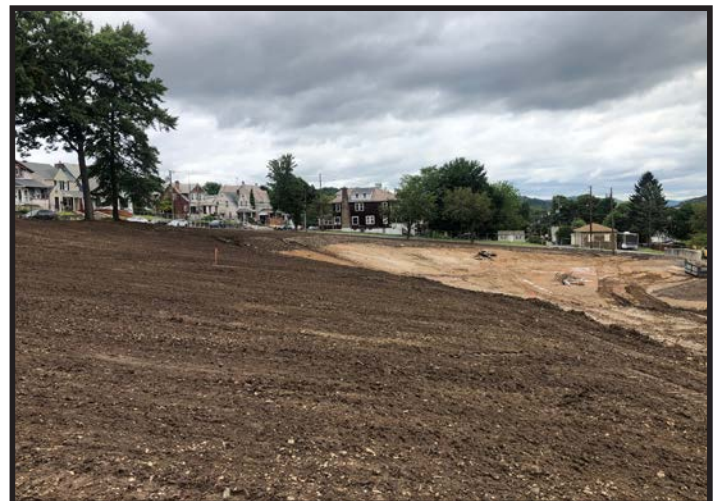
August 8, 2023